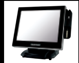
Magnetic Card, Biometric