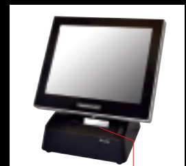
Built in Printer